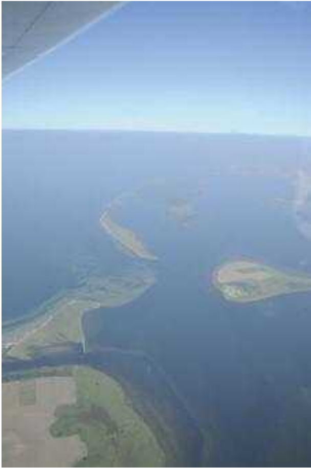
The German archipelago