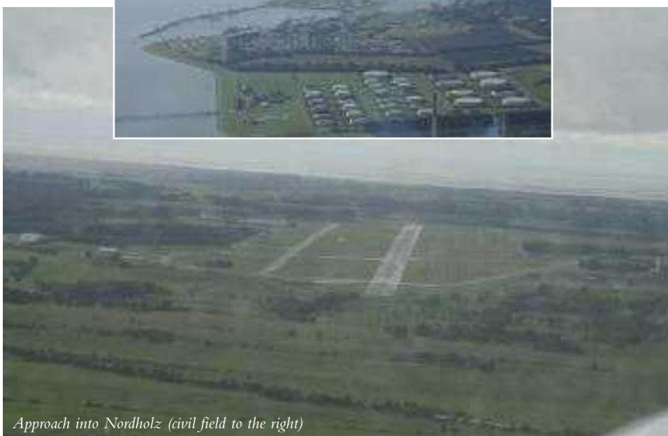
Approach into Nordholz (civil field to the right)