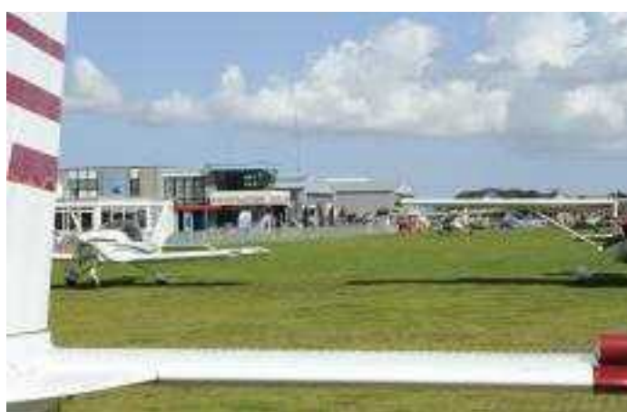
A busy Texel