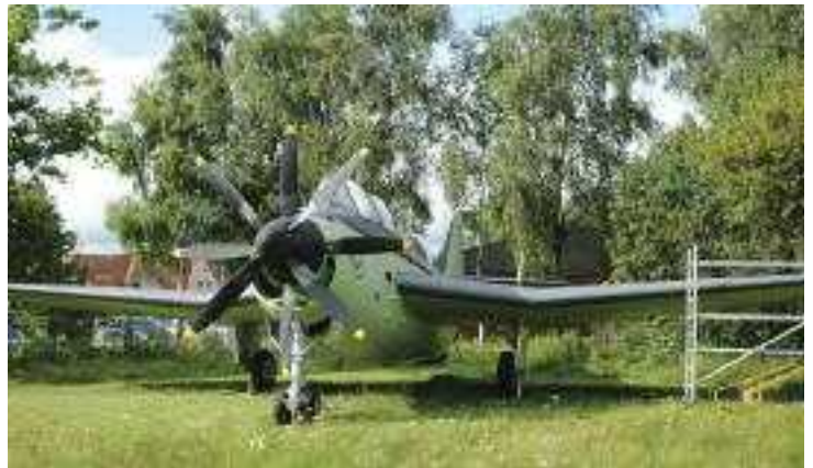
A German Gannet - the fruits of Winkle's work

beach and swam in the tideless and salty waters of the Baltic, over which those V1s and V2s were launched all those years ago.