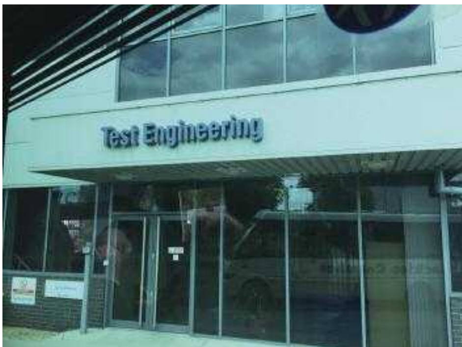
Test engineering department

Next came a brief visit to the Plating Shop. An exciting new development here