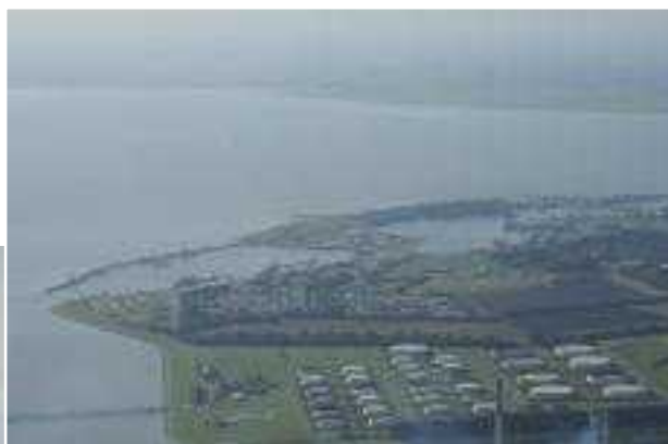
Wilhelmshafen, an early Bomber Command target