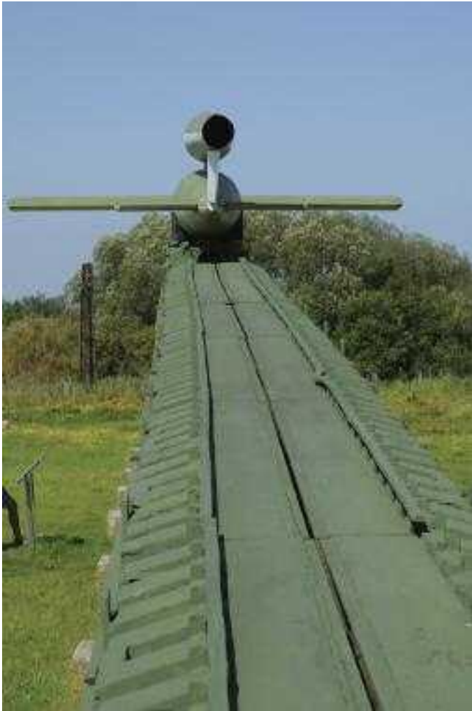
V1 on ramp (acquired from the UK)