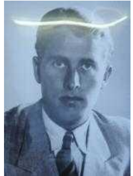
Werner von Braun, rocket supremo