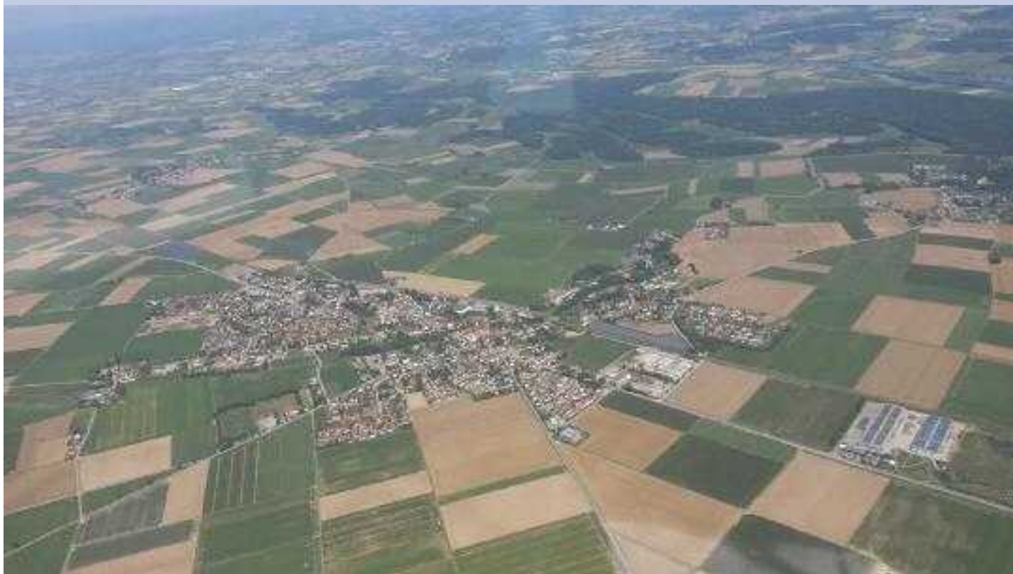
Editor's photo of Strasskirche below

On my return route from a summer visit to Austria, I deviated only 5 miles from my direct route to fly over Strasskirche, the (then) little village outside Straubing where Melitta met her maker. There was no geographical cover for her to escape the P47 Thunderbolt that was pursuing her. If she had only been 15 miles to the East, woods and small mountains would have given her hope.