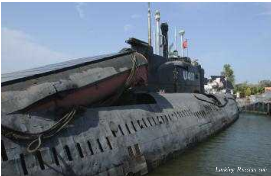
Lurking Russian sub

controller was working like a one-armed paper-hanger, dealing with aircraft from Land's End to Dover to way up in the Midlands. It was almost impossible to get a word in edgeways so it was with some relief when we coasted in near Yarmouth to change to the quiet of Tibenham's frequency. As we approached the westerly runway to land I was glad to see my Morris Minor still parked by the hangar after four days away. Our total flying hours were 9hrs 5mins, we visited two fascinating places and learnt much. My great thanks go to the Editor for asking me along.