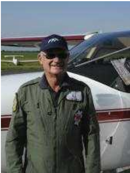
The author before departure from the UK