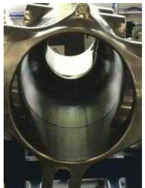
BOTTOM RIGHT - A bored forging